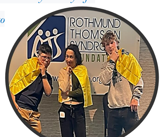
RTS Teen Superheroes!!

'I always love the time to connect with other families'